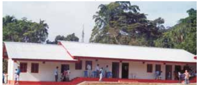
Reconstructed school at Korang Nalah A & N by BJS