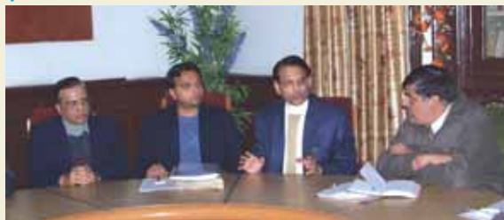
BJS team with J&K officials

Many of these boys will be encouraged to support other relief and rehabilitation activities, thus helping people actually get benefit from their own experiences.