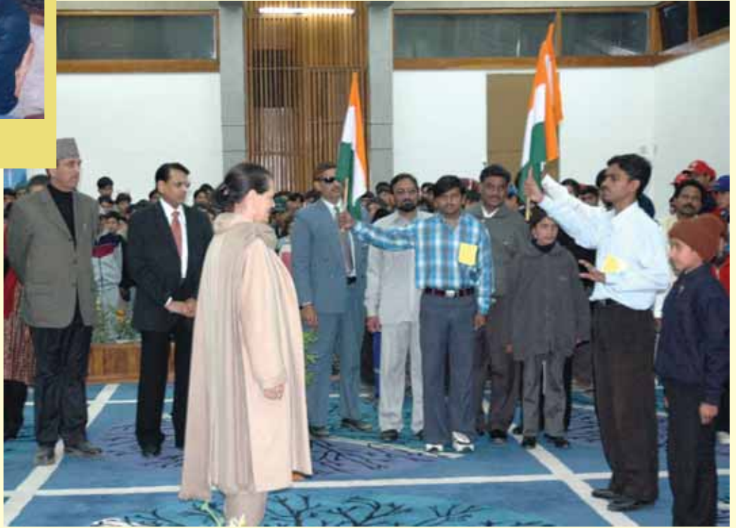
Smt. Sonia Gandhi with J&K Chief Minister Shri. Gulam Nabi Azad and BJS team at the Flag off Ceremony at Srinagar on 10th November 05