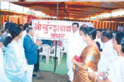
Temporary shelters for Akola Flood affected people