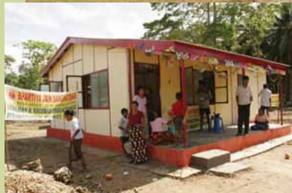
Reconstructed PHSC at Hutbay A & N by BJS