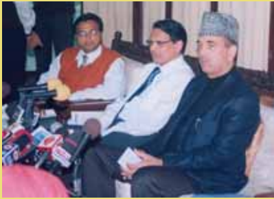
BJS team with J&K Chief Minister Shri. Ghulam Nabi Azad at the joint press conference